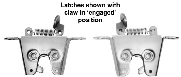
GD16-G01183 (LH latch, without moulded cover)